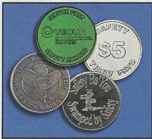
These custom-minted coins serve as a tangible reminder of the importance of work site safety.

Looking for a unique way to reward employees for work site safety? Osborne Coinage Company may have just the answer for your safety program.